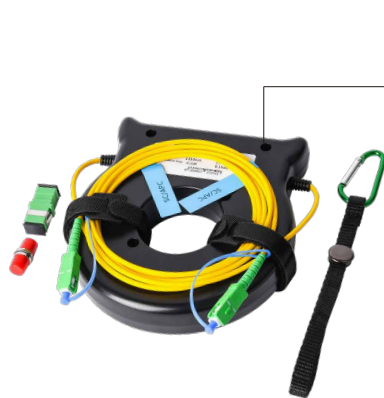
Adapters special storage bin design